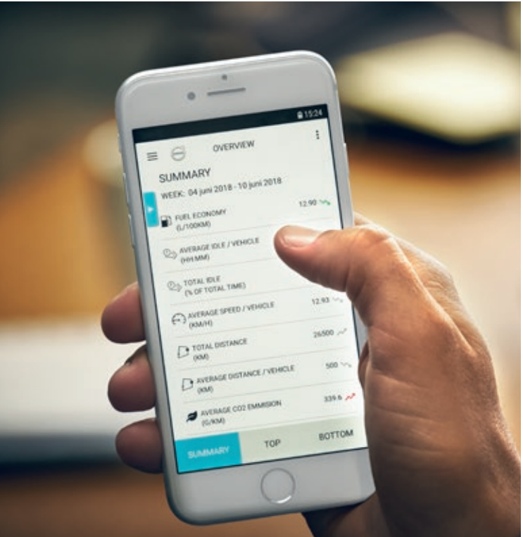
The Volvo Connect smartphone app provides regular reports for your new Volvo coaches. It gives you a clear overview of vehicle and fleet parameters such as fuel economy, emissions, idling, average speed and distance.

I-Coaching is a clever device which gives the driver instant feedback on driving performance. Over-revving, idling, overspeed as well as harsh braking, acceleration and cornering are monitored. And when you add Coaching Zones you set limits for those parameters in defined geographical areas.