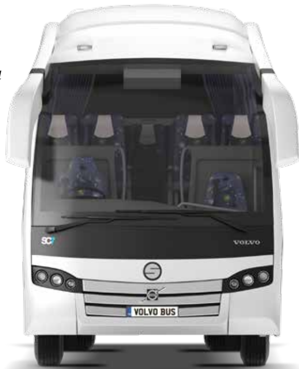
B11R Sun Sundegui SC7

With Volvo quality inside you have a solid base for long-term productivity.