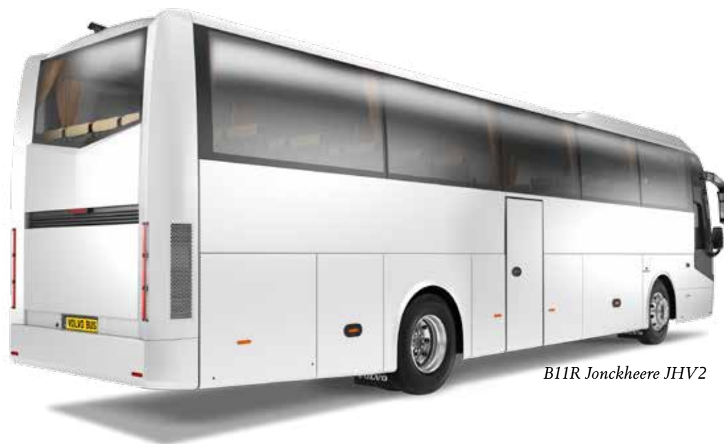
B11R Jonckheere JHV2

Premium charter or cost-efficient transit? With the Volvo B11R you will get just the coach you need. Two or three-axle configuration combined with several power ratings allows you to optimise it for your specific operation.