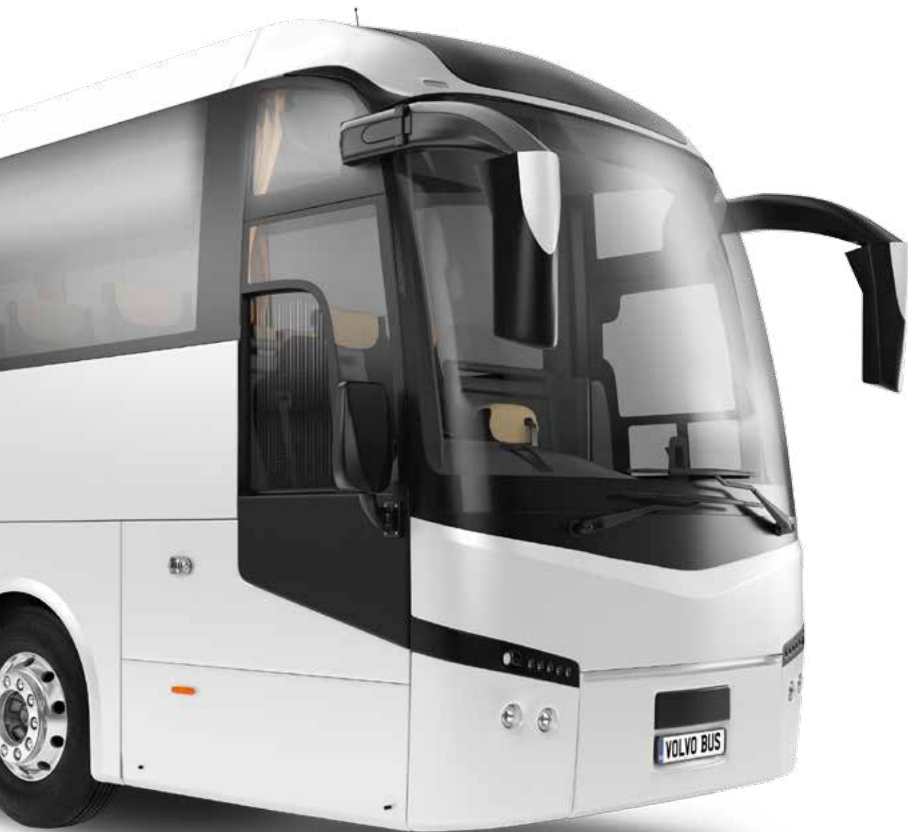
B11R Jonckheere JHV2