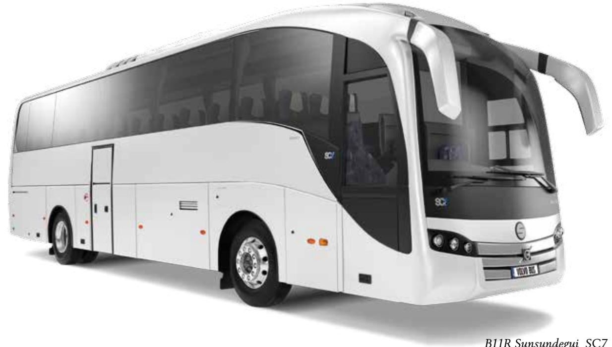
B11R Sunsundegui SC7

With the Volvo B11R as a base you can build just the coach you need. This versatile chassis provides maximum flexibility for bodybuilding and opens up for a wide range of applications. No matter whether you aim for a premium coach, a tour and charter money-maker or a transit workhorse. It's still Volvo quality and reliability all the way.