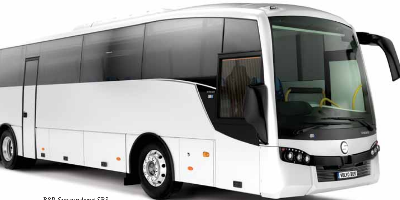
B8R Sunundegui SB3

The Volvo B8R is all about versatility and flexibility; capable, reliable and ready to take on a wide range of assignments. When you specify a complete full-service commuter, touring or express fleet, the Volvo B8R will help you create exactly what you need to maximise productivity in your operation.