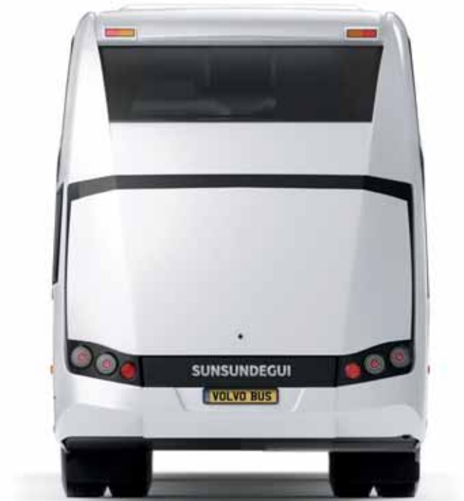
B8R Sunsundegui SC5

Add services such as Vehicle Management and Service Contracts, and you can count on what matters: maximum availability. Our "European Blue" Contract comes as standard (2 years, 160,000 km).