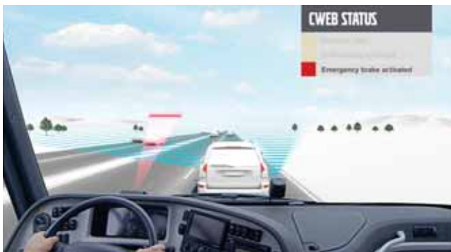
CWEB, Collision Warning and Emergency Brake , detects the vehicles in front and warns the driver when there is a collision risk. If the warning is ignored it is escalated and first followed by gentle braking, and then by emergency braking with maximum retardation.