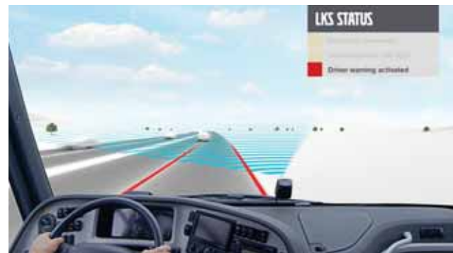
LKS, Lane Keeping Support , monitors the lane markings and alerts the driver when the risk of an unintentional lane departure is identified. The warning is given as a vibration in the seat, or as an acoustic signal.