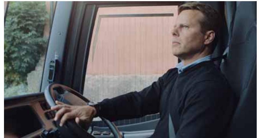
VDS, Volvo Dynamic Steering , features a powerful electric motor assisting the power steering mechanism. The driver benefits from increased stability, less strain and the unique return-to-zero capability. (optional extra)

With Driver Support the operator will benefit from fewer accidents and reduced injuries in the event of a collision.