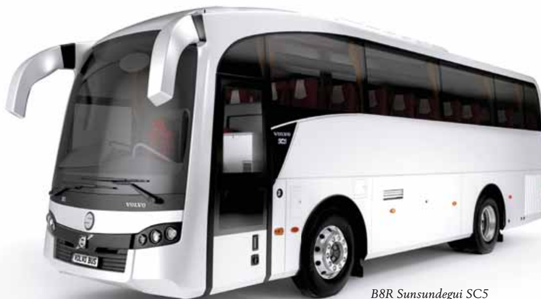
B8R Sunsundegui SC5

Our promise is to be your best business partner, with services to maximise uptime, reduce life cycle cost and facilitate the management of your fleet.